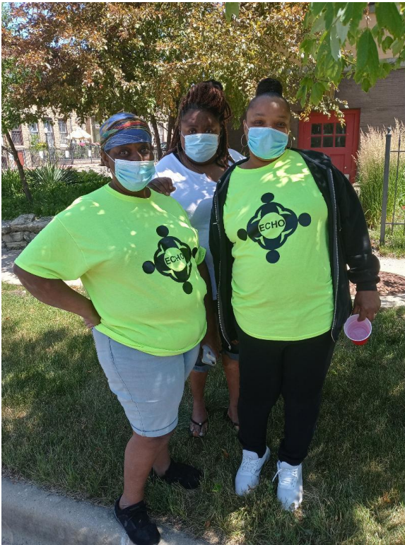
OUR TEAM OF DEDICATED WORKERS

The Mission of Echo Development Center is to enhance the positive growth of youth and seniors in Kane, Kendall, and DuPage Counties by providing Social, economic, health and educational Services that promotes and strengthens the abilities of youth and families. These services are designed to stimulate positive growth and improve the quality of life of youth, families, and seniors.